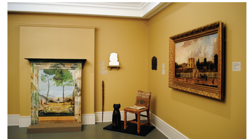
A Show of Hands , silhouette replacing " The Arms of Nova Scotia ," Hudson Langille, c.1920.